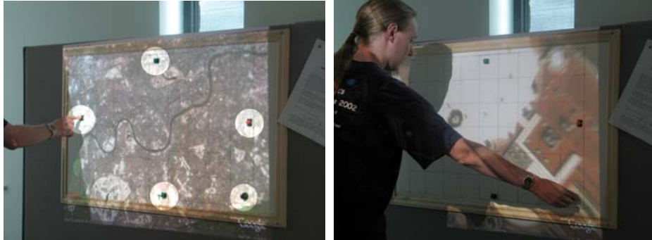
Fig. 5. The layout of controls as originally sketched (left) and interface occlusion (right)

He was able to pan and zoom in and out using the controls, although the interaction seemed slightly uncomfortable at times. For example he was standing to the left of the board most of the time as to not occlude the projected image, except when reaching for the zoom dial (Fig 5, right). Also, he is left-handed so manipulating this control with his right was not ideal. So he unfastened the zoom dial from its original position and attached it instead to the top left corner of the board (Fig 6, left). Problems solved.