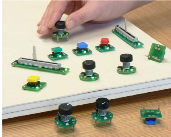
Fig. 1. VoodooIO provides devices that can be flexibly arranged on an interactive substrate.