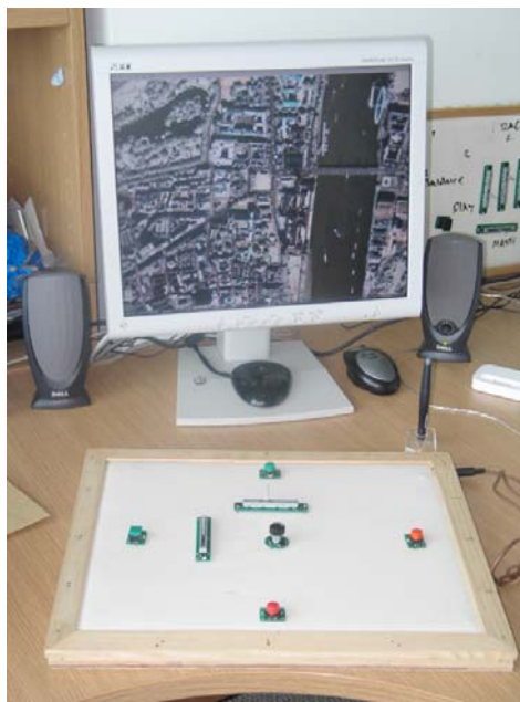
Fig. 3. Desk prototype using a VoodooIO tablet.

This was quickly implemented and tested on a VoodooIO tablet (Fig 3). The complete implementation and debugging time was about an hour.