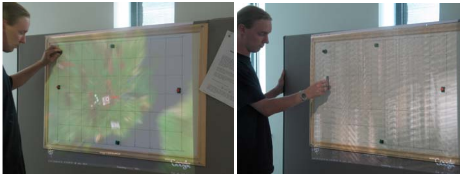
Fig. 6. The zoom dial quickly repositioned (left) and trying out a slider for panning (right)

He was able to pan and zoom in and out using the controls, although the interaction seemed slightly uncomfortable at times. For example he was standing to the left of the board most of the time as to not occlude the projected image, except when reaching for the zoom dial (Fig 5, right). Also, he is left-handed so manipulating this control with his right was not ideal. So he unfastened the zoom dial from its original position and attached it instead to the top left corner of the board (Fig 6, left). Problems solved.